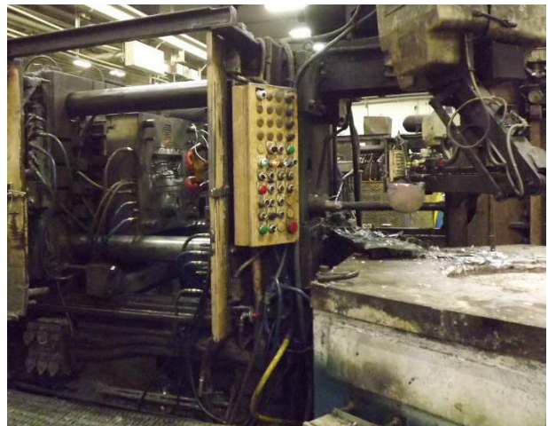
PHB die casting machine

The dies for the Lower Heat-sink and High Beam Heat-sink are single cavity dies with interchangeable inserts that can cast either a Right or Left Hand part in a 600 Ton Machine. The Aiming Bracket die is a two cavity die that produce a Right and Left Hand part in a 1400 Ton Machine.